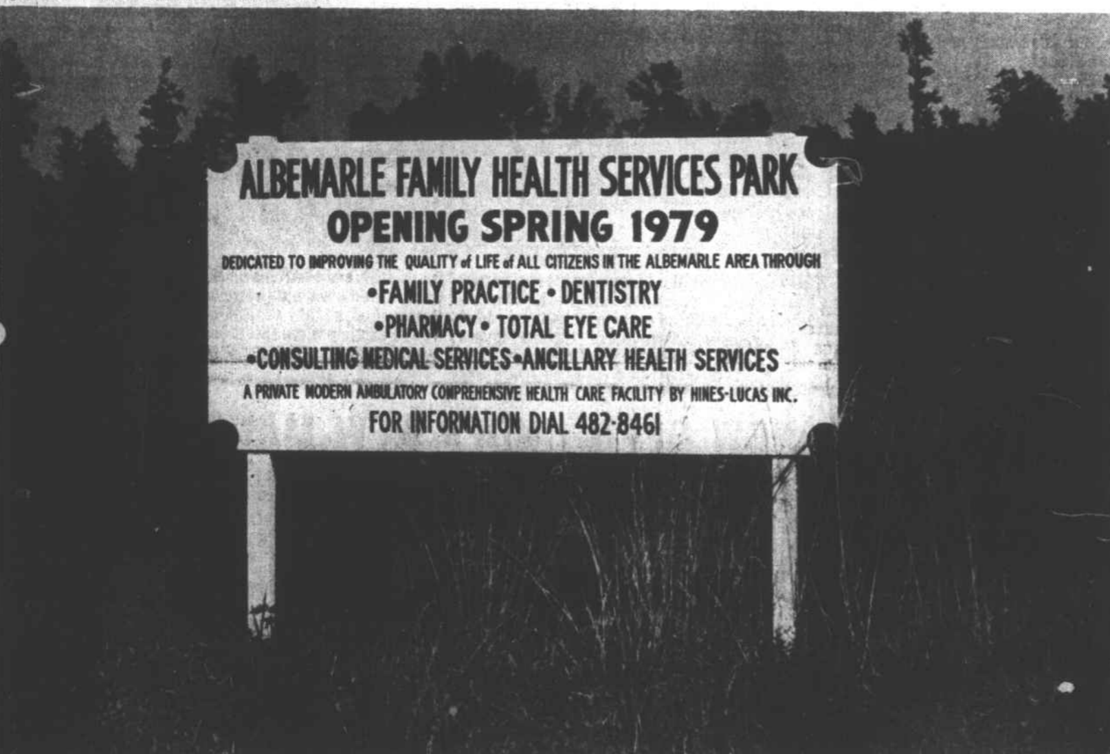
SIGN OF FUTURE PLANS — While Albemarle Family Practice, Ltd. has enjoyed a thriving business since opening its doors, plans for meeting the needs of local citizens have not stopped there. A partner-

The project is being designed, according to Lucas, by "probably the most innovative health care team in the country." Its appearance will be rather "unique looking" and is designed for flexibility so it can easily be added to or taken from allowing rearrangement of inside space. It will include total landscape design.