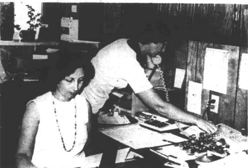
EFFICIENT OFFICE — Part of the businesses and professional firms includes much paper work and scheduling

Practice, Ltd. is currently operating. The first phase of the project, expected to be completed in about a year, has a projected cost of $1 million.