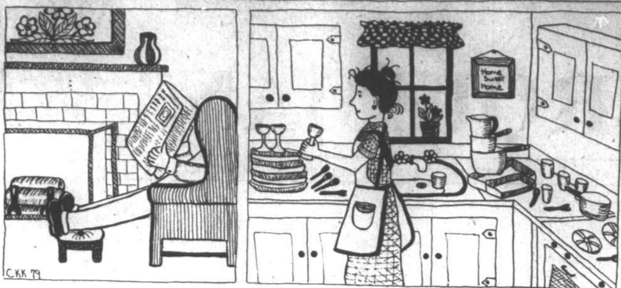
"Father's Day, Mother's Day — there's a difference?"

"ALL SUBSCRIPTIONS PAYABLE IN ADVANCE" Published By Advance Publications Inc. Elizabeth City, N.C.