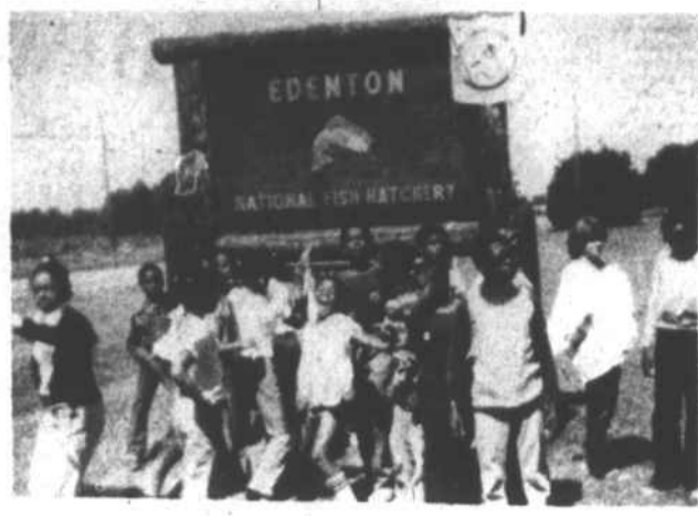
FISH HATCHERY TOUR — Children taking part in the EFNEP Youth Day Camp toured the Edenton National Fish Hatchery as part of the two-day activities.

Fire and lightning insurance rates for North Carolina's public schools are lower now than they were 30 years ago. More correctly, local school units who insure their facilities through the Division of Insurance in the Department of Education are recipients of these lower rates.