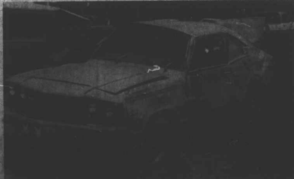
WRECKAGE — This is what was left of an automobile involved in a fatal accident at the "Y" last Friday night. Killed, was a Marine from Camp Lejeune. Five others in the car were injured.