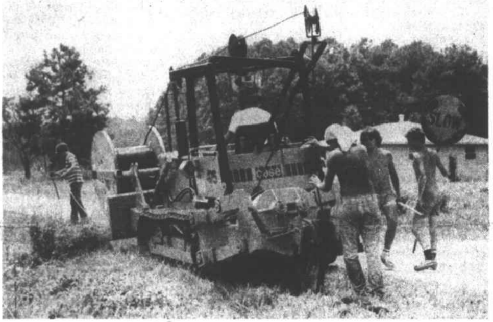
NEW PHONE CABLE — A crew lays a "relief cable" in an operation that has been worked on for about six weeks. The cable is being laid from Highway 17 out the Harvey's Point Rd., across to the Holiday Island Rd. and into Holiday Island. The specially designed tractor digs a two foot deep trench and lays the cable in one continuous operation. The new cable will make possible the installation of between 100 and 200 new phones at Holiday Island.