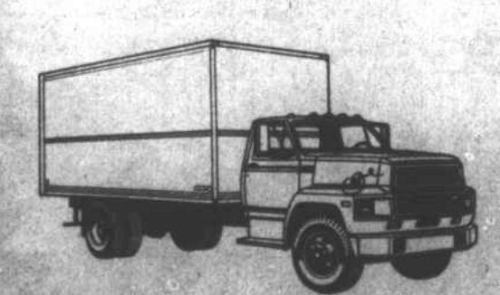
The most popular trucks in the mcdium-duty field ... because they stay on the job and save on the job. America's best-selling medium trucks for the past