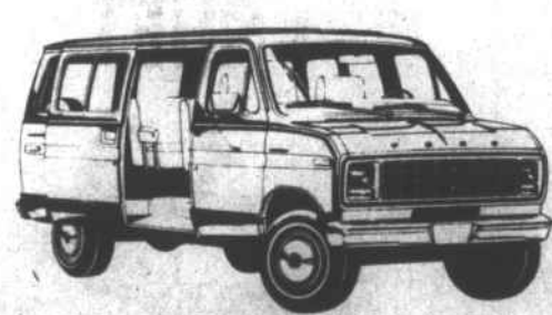
SMART CLUB WAGONS! Top utility, styling and comfort, to meet many family needs . . . like Ford's exclusive Club room!