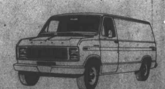
VANS BUILT FORD TOUGH!