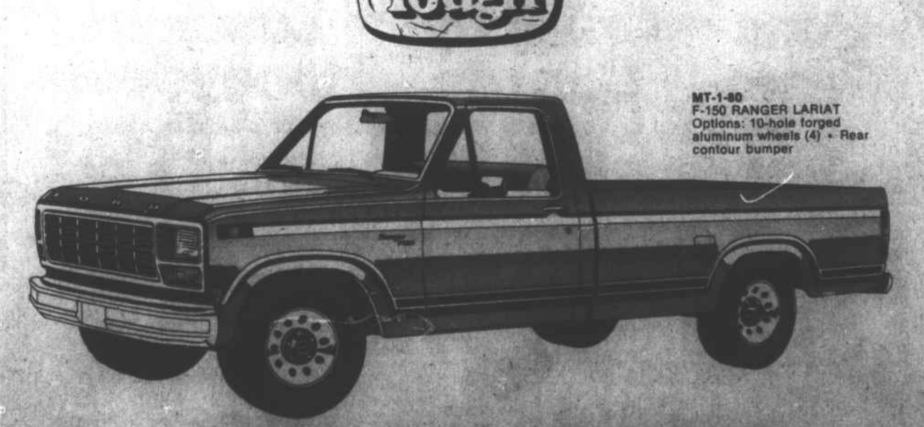
THE 80's ... FORD PICKUPS