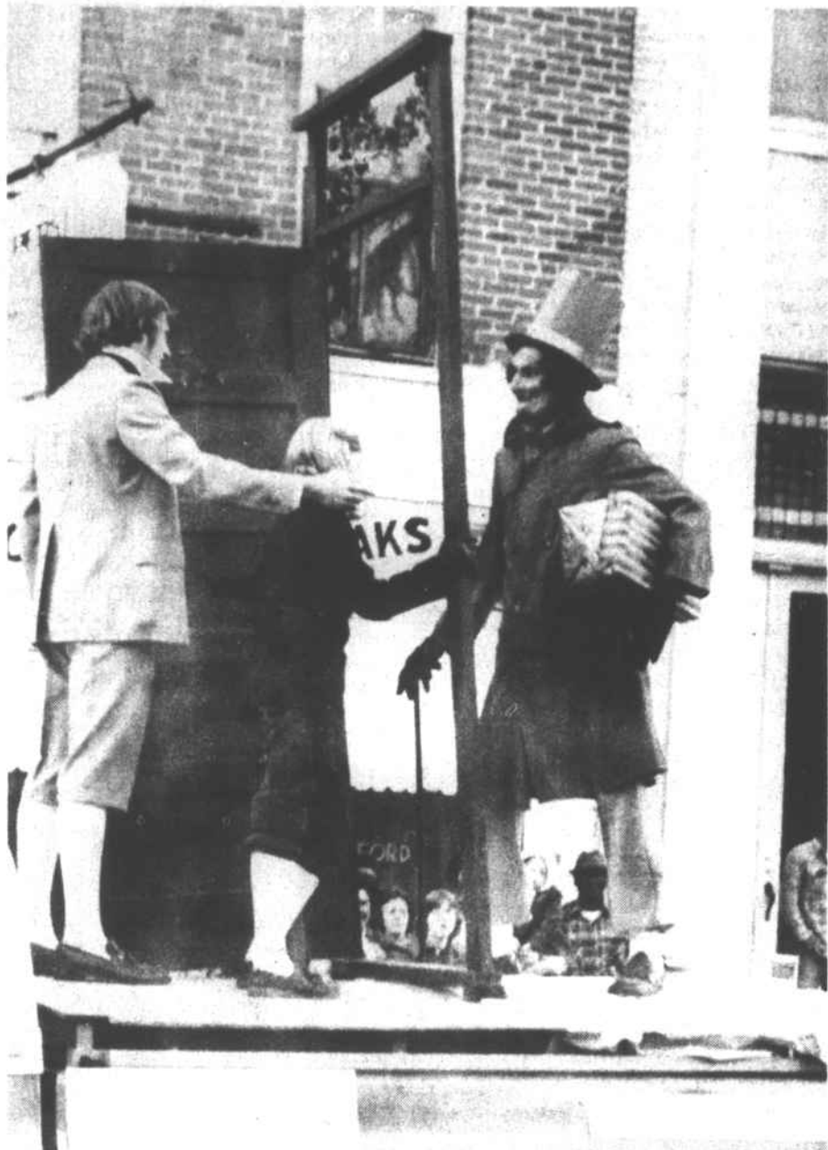
Even Scrooge catches Christmas spirit

The parade was sponsored by the Perquimans County Jaycees and the Perquimans County Chamber of Commerce, and was deemed a success by those who organized it.