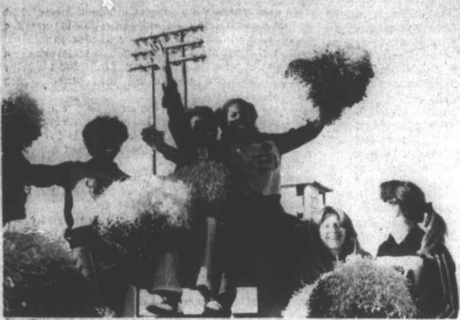
A Christmas cheer from PHS

It was a perfect day for a parade. Even the weather man had cooperated and put a seasonal nip in the air.