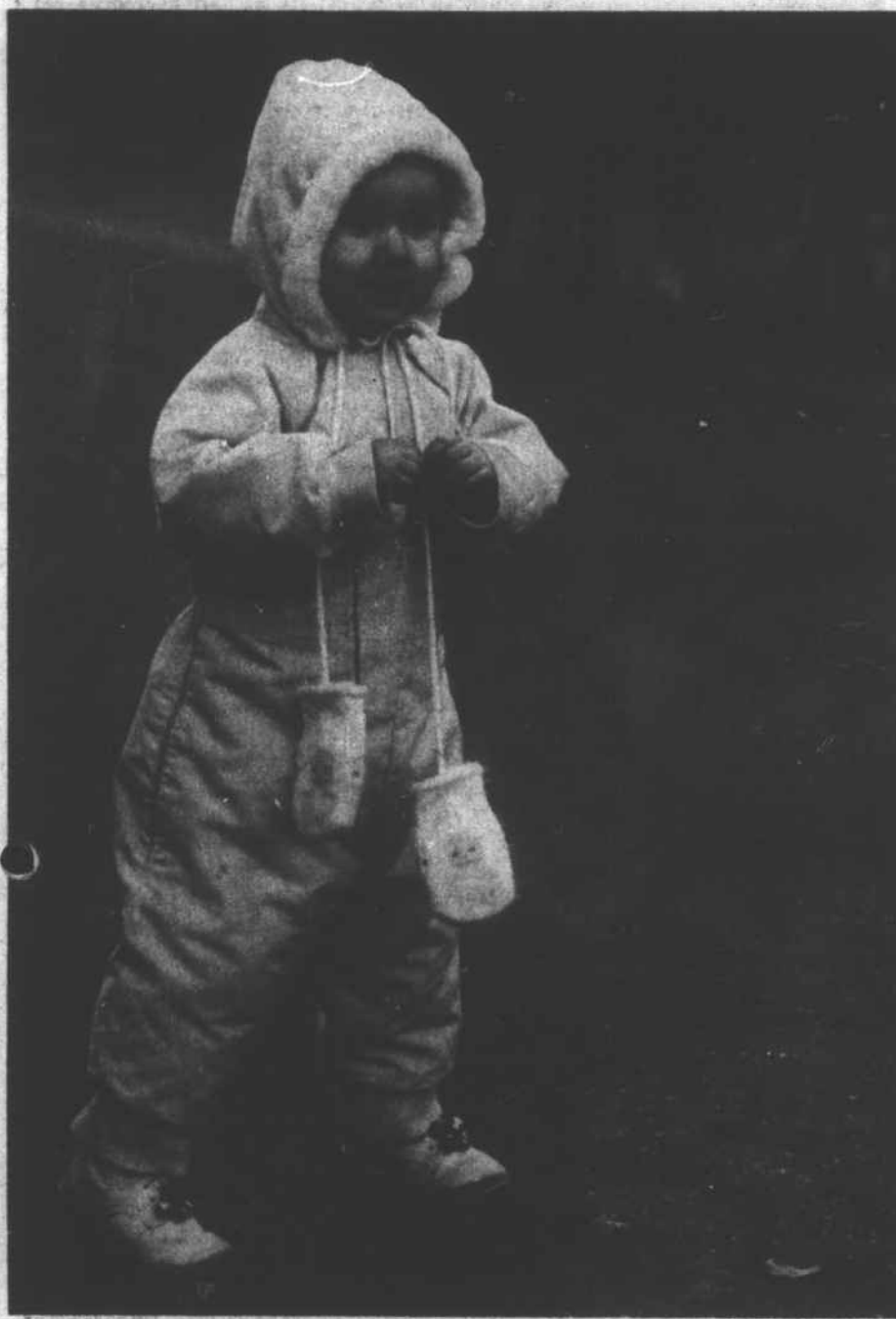
Parade fans come in all sizes