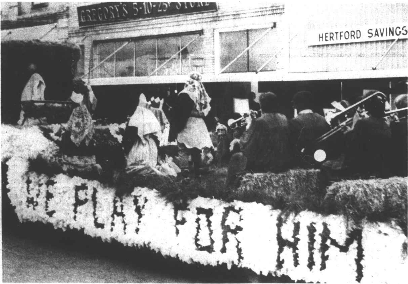
Band Boosters' float captures meaning of Christmas