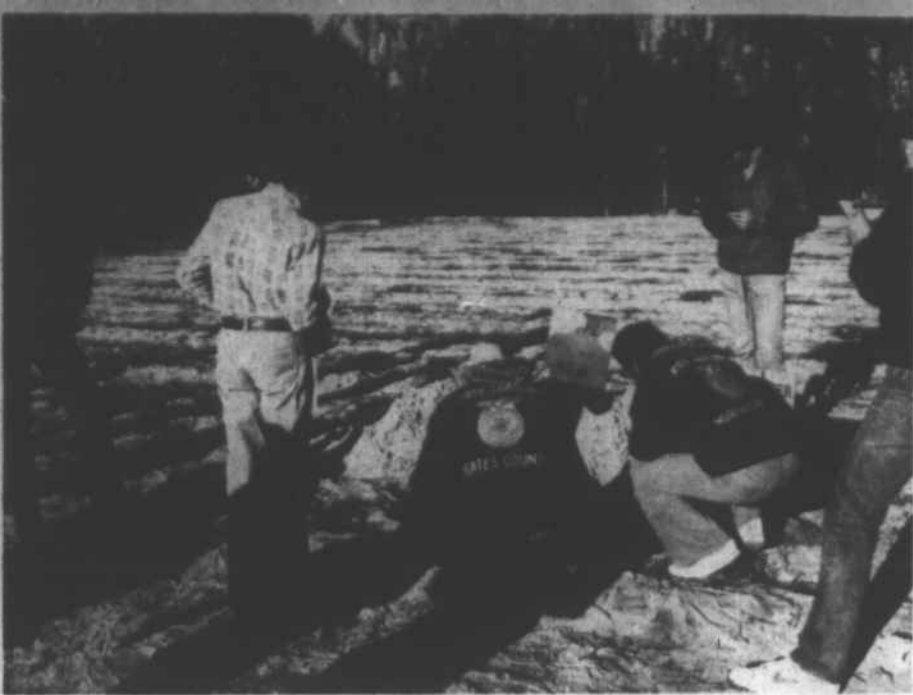
FFA land-judging students inspect a soil pit at the annual contest held this year in Martin County.