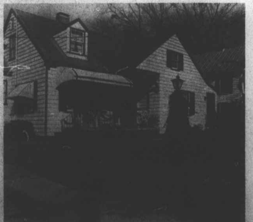
The Chappell home in Winfall