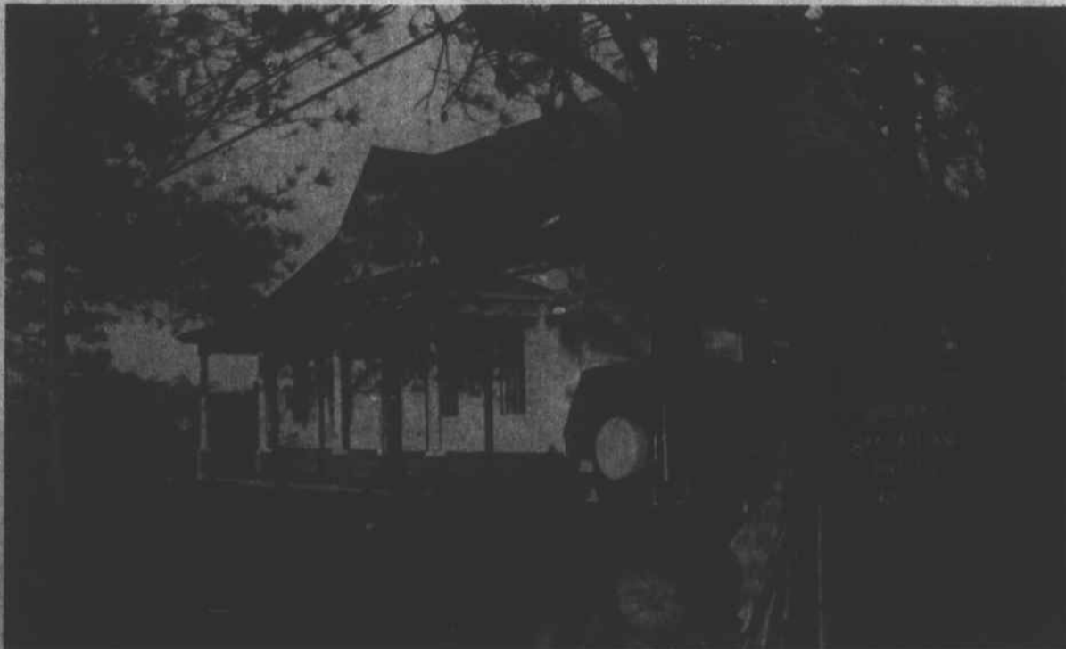
The Three Bears Day Care in Hertford

The Perquimans County Extension Homemakers and the Agricultural Extension Service will sponsor their Annual Christmas Raffle and Homes Tour next Thursday from 7 to 10 p.m.