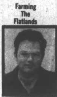
Farming The Flatlands

Cultivation should be used to control any Johnsongrass seedlings escaping from the herbicide.