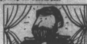
U.S. Grant's real name was Hiram Ulysses Grant.

May 5 - Bible Study Class, 1-3; District 1-B meeting, 2. Call the center now to reserve your seat for the Botanical Garden tour trip, May 24. Cost is $10.