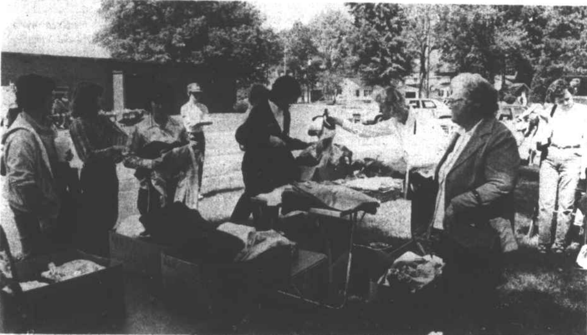
Turning trash into cash and finding unexpected treasures add to the appeal yard sales.