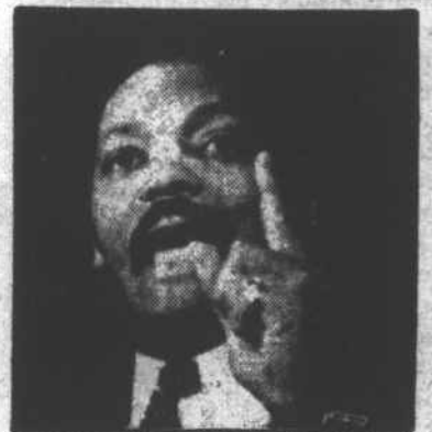
Rev. Jesse Jackson considers presidential bid