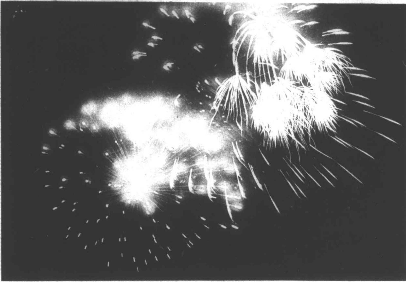
Bursts of light

Over 500 people viewed the magnificent fireworks display presented by the Perquimans Jaycees July 4. The annual "Fourth" celebration drew crowds of people in spite of the high temperatures and threatening storms. Held at Missing