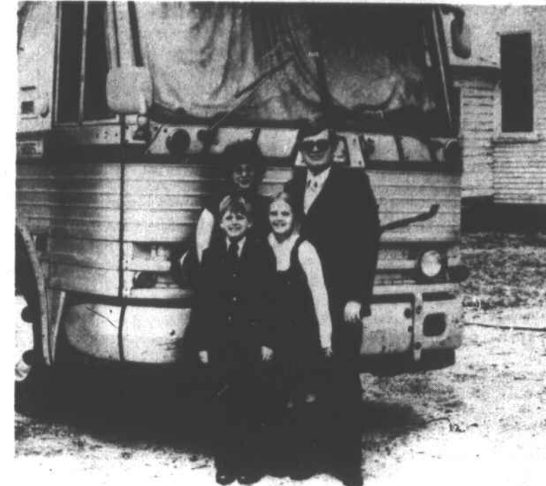
The Lochridge Family

Revival services will begin nightly at 7:30 with special music being provided by local church choirs and