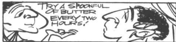
The Greeks and Romans used butter largely as a medicine, preferring olive oil as a cooking fat.

Drop by tablespoonfuls on baking sheet. Bake at 350 degrees for 10-12 minutes. Yield 4-6 dozen. (You may also bake the dough in a sheet pan and cut into squares. Cooking time approximately 25 minutes.