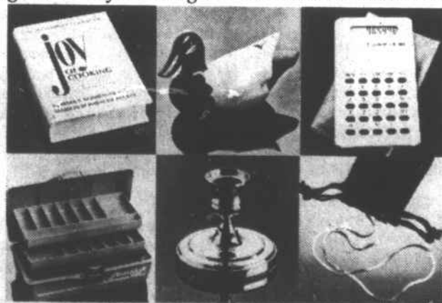
Joy of Cooking cookbook, Canon solar calculator, Wooden duck decoy, Fishing tackle box, Baldwin brass candlestick, Sterling silver herringbone necklace.

And that's not all. Right now, you can also get one of these free gifts when you sign up. But do it soon. The offer, and the supplies are limited. North Carolina's best banking. Right in your neighborhood.