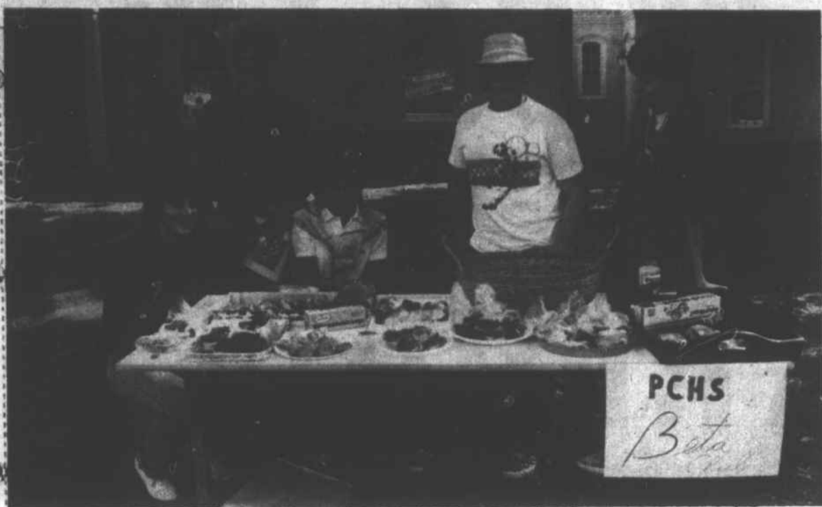
Beta Club holds bake sale

The Perquimans County High School Beta Club offered a variety of tempting baked