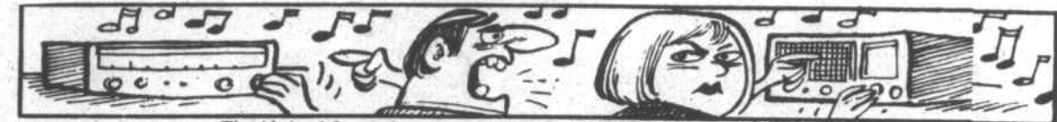
The United States has more radios than any other country in the world.

The efficiency of agriculture is demonstrated by the fact that one farm worker supplies enough food and fiber for 76 people. How's that for "entrepreneurship!"