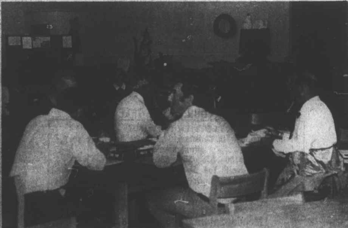
Perquimans County Board of Education members met Monday night in the newly renovated library at

•It was also announced that the court heard the cases concerning the fire at Perquimans Union School last year.