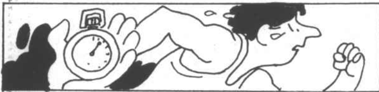
Roger Banister, the English runner, was the first man to break the four minute mile. He did it in 1954.

will stay and visit until 4:00 p.m. All ages are welcome. Refreshments will be served.