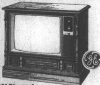
25" Diagonal CONSOLE COLOR TV Model 25PC3804P