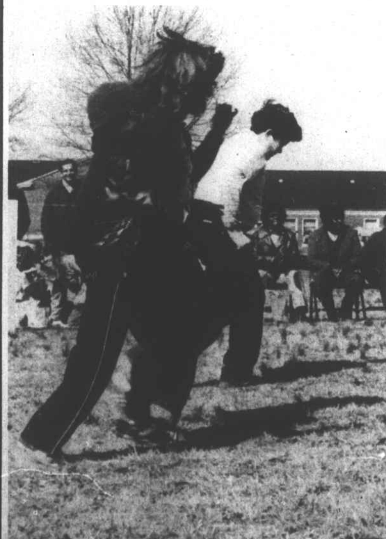
Pictured are Olympians on the local level, from 1984 in competition

The Perquimans County Special Olympics, Spring Games, will be held Friday, March 29th at Perquimans Central Grammar School. The opening ceremony will begin at 9:30 a.m.