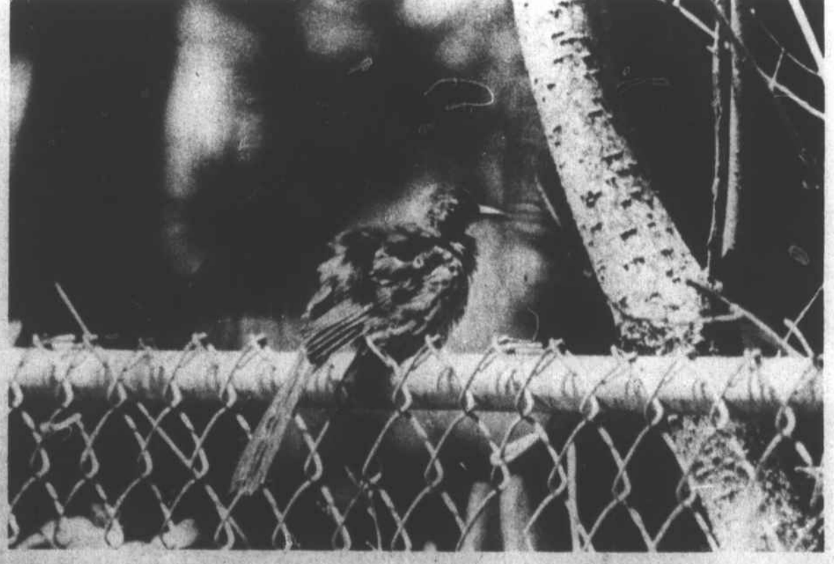
RIDING THE FENCE — May be a popular habit for politicians but, it is apparent that some birds like it, too! This fat fuzzy little creature perched itself on the fence