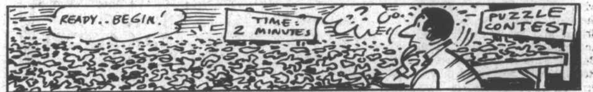
The largest jigsaw puzzle in the world measured 15 feet by 10 feet and contained over 10,000 pieces.

These new regulations were enacted by the Wildlife Resources Commission and the Marine Fisheries Commission in order to conserve dwindling stocks of coastal striped bass.