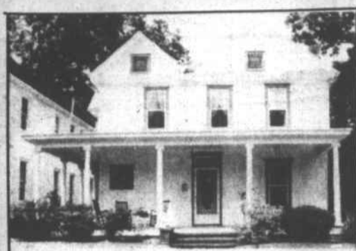
0126 CHURCH STREET: 4 BR, 2 1/2 bath. Great for family living..... $52,000