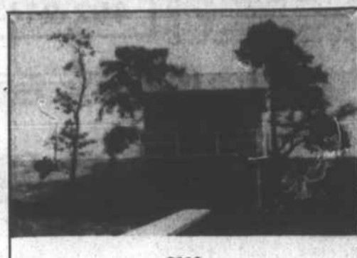
0118 MATTHEWS BEACH: A nice second home located on Perquimans River..... $77,500

We have many more excellent listings in various price ranges. CALL US TODAY!