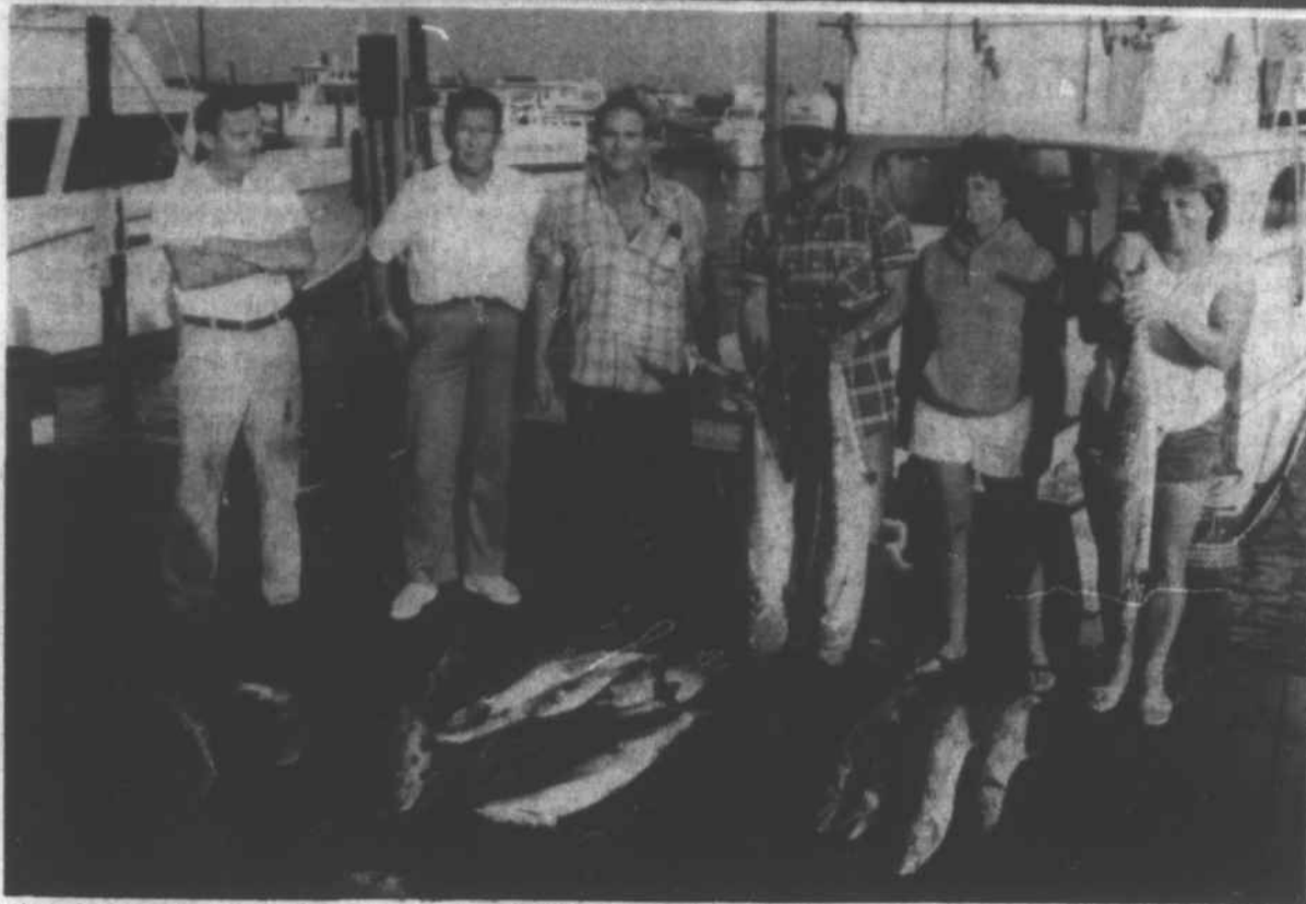
These Hertford anglers are happy to display a fine catch of yellow-fin tuna, shark and king mackerel they landed while fishing from aboard the