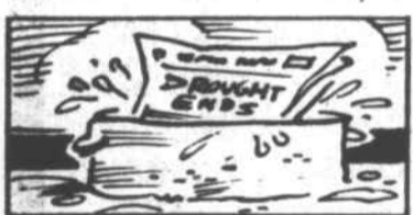
It takes about 150 gallons of water to make the paper for one Sunday newspaper.