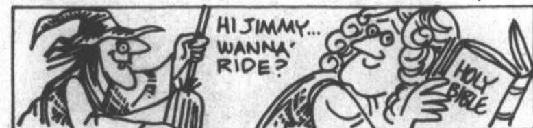
King James I of England, one of England's most learned monarchs and sponsor of the Authorized Bible, believed in witchcraft.