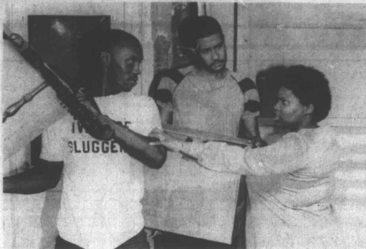
Rehearsing a scene from the ECSU University Players' production of "A Raisin in the Sun" are (left to right)