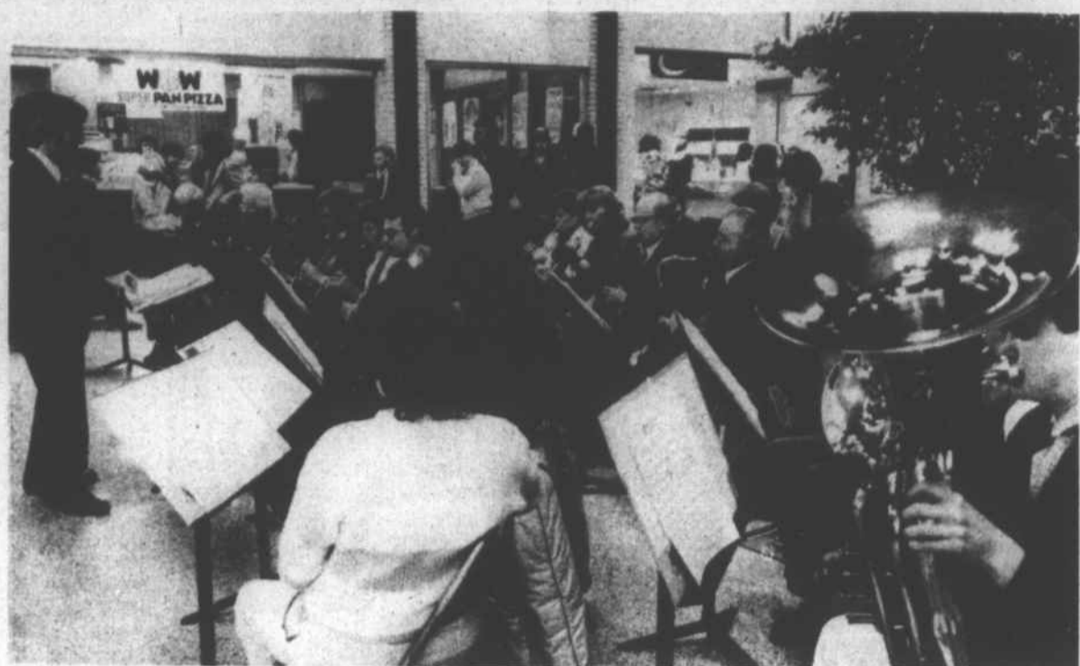
HOLIDAY TREAT -Shoppers received a special gift last week when the College of The Albemarle Band performed a modern medley of holiday