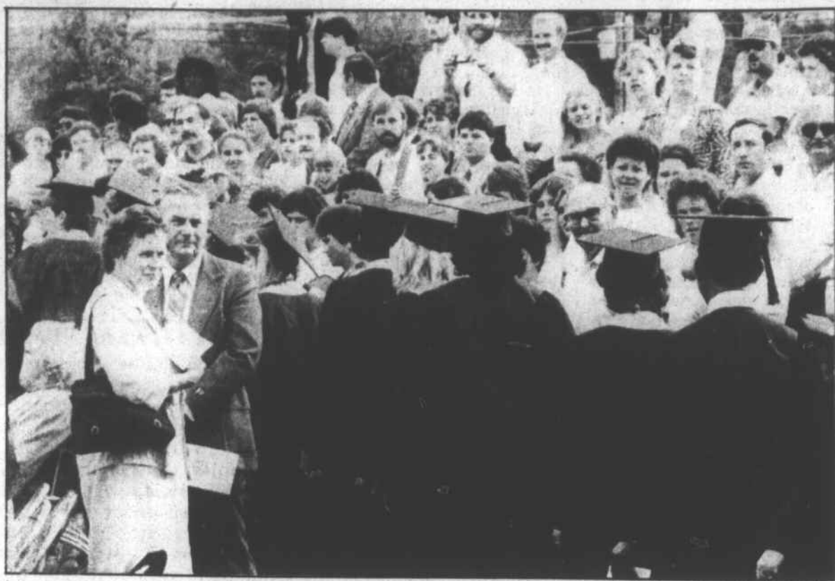
COA GRADUATION—A crowd of more than 600 parents, relatives, and friends assembled on the front lawn at College of The Albemarle to witness the college's twenty-third spring commencement exercises on May 30, where 129 graduates received a total of 134 degrees.

Following graduation, she will work with The First Boston Company in New York City as an associate in their corporate finance department.