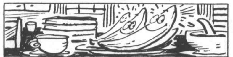
Don't throw out overripe bananas. Mash or sieve them, sprinkle on a little lemon juice and freeze. Use later in cake or bread batter.