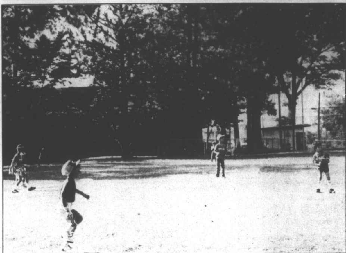
T-BALL TIME —Perquimans County has raised a crop of "Little Sluggers" as you see here. Approximately 60 youngsters are currently participating in the t-ball league sponsored by the Perquimans County Parks and Recreation Department. The season, which started on Monday, will last through the month of June.