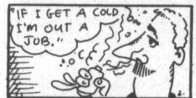
A professional perfume tester is known in the trade as a "nose."

In last week's edition of The Perquimans Weekly a composition error caused two Letters to the Editor to become intermingled. We regret the error. To eliminate confusion you will find each of the letters reprinted on Page Four of this week's edition.