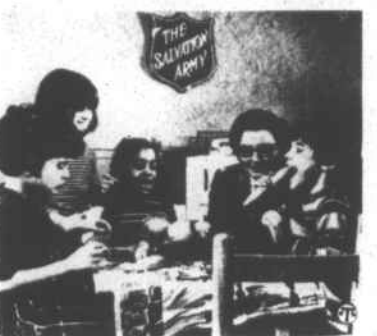
Social services offered by a private organization are saving the government and taxpayers a great deal of money.

It's a group that sponsors day care programs for the very young, golden age programs for senior citizens, recreation programs and camps for teens and the handi-