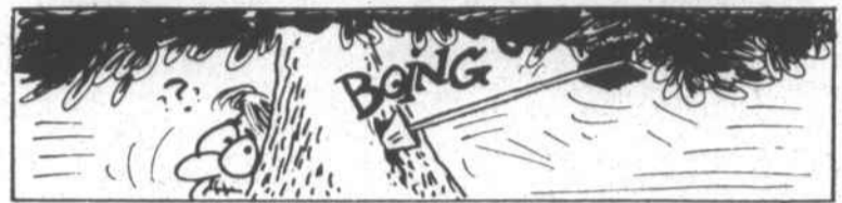
In Finland it was once considered a sign of piety to shoot arrows at trees.