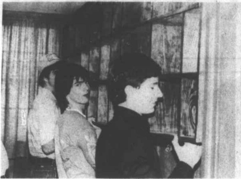
Above members of the Perquimans County Future Farmers of America install some shelves which they built for the Perquimans County Agricultural Extension Office.