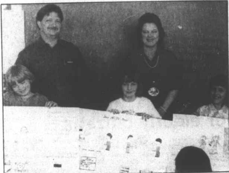
Below are bookmarks which were made by the class in observance of media day.