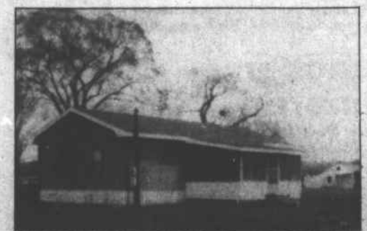
CAMP PERRY ROAD 3 bedroom 1 1/2 bath modular on 2 1/2 acres 15 minutes from town. Nice workshop in back and newly painted ..... $38,000

Lot ..... 297-2513 Teresa ..... 297-2513 Stephanie ..... 330-4461