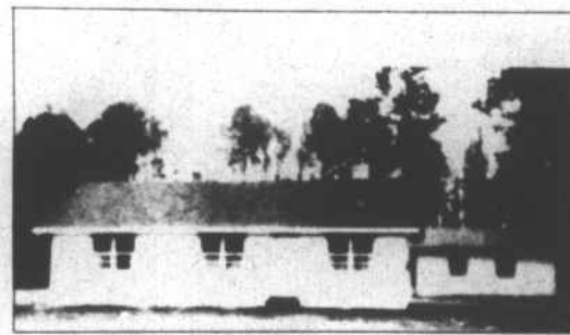
HERTFORD nice home in country. 3 bedrooms, 1 bath, some furniture. Large lot that includes floored workshop ..... $40,000