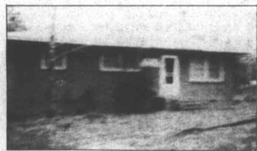
SNUG HARBOR 2-3 bedrooms, outside building w/water and electricity. Great for starter home or weekend home ..... $28,000