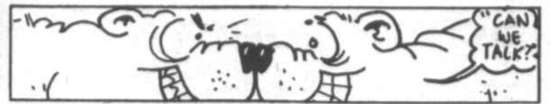
Bears in the aggregate are called a sleuth.