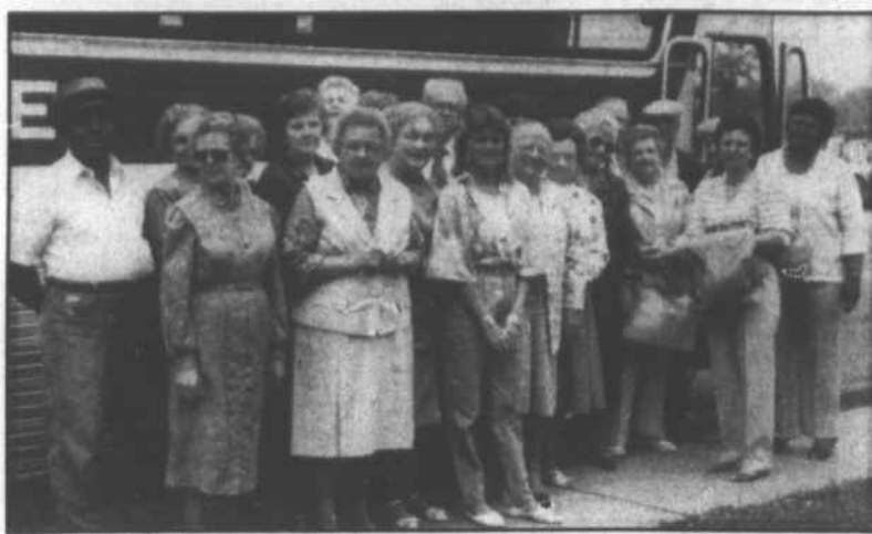
Above members of the Perquimans County Senior Center prepare to journey to Norfolk, VA for a visit to Wells Theatre. The group ate lunch at Morrisons' Cafeteria, and then watched a show. The trip was enjoyed by all.

Immunizations are available from private physicians and local health departments throughout the state.