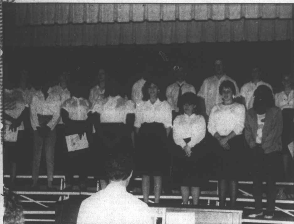
Above the Perquimans County High School Chorus performs during the extravaganza.