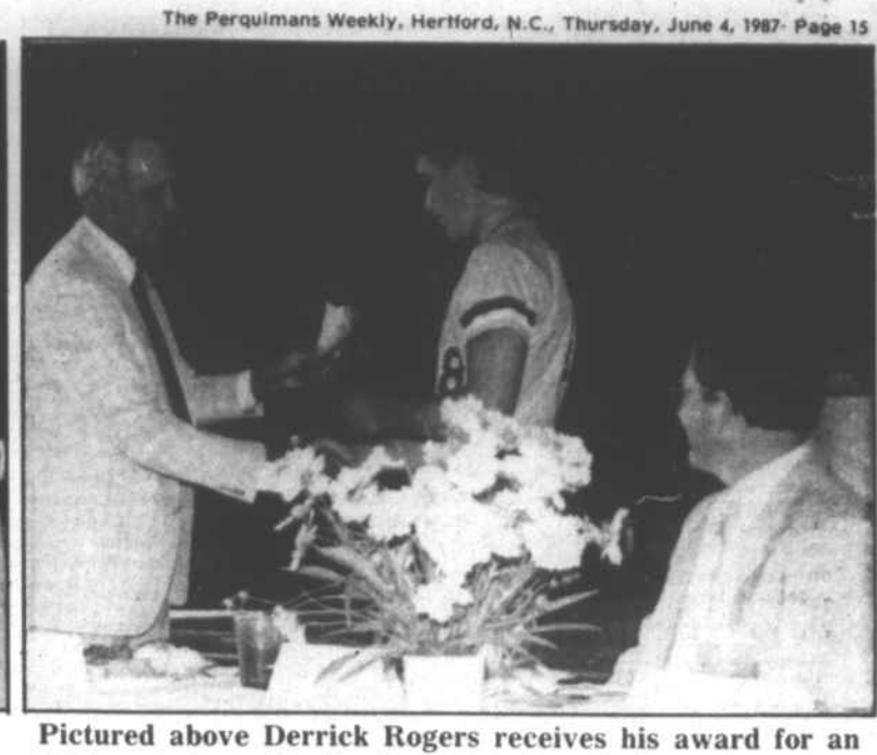
"A" average during the Academic Awards Banquet.