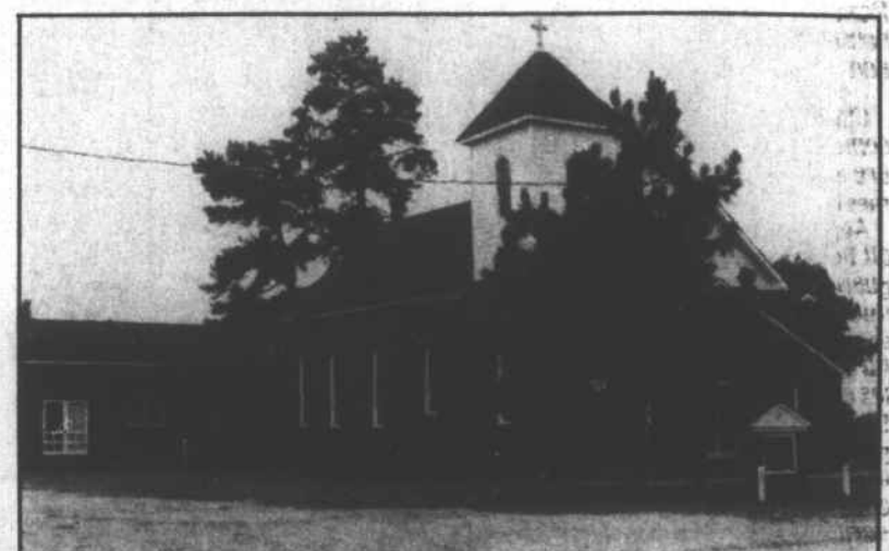
Bay Branch A.M.E. Zion Church