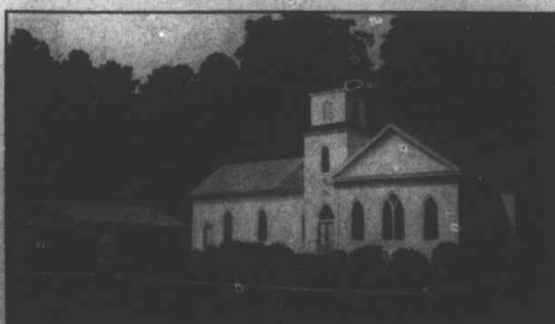
Anderson's United Methodist Church