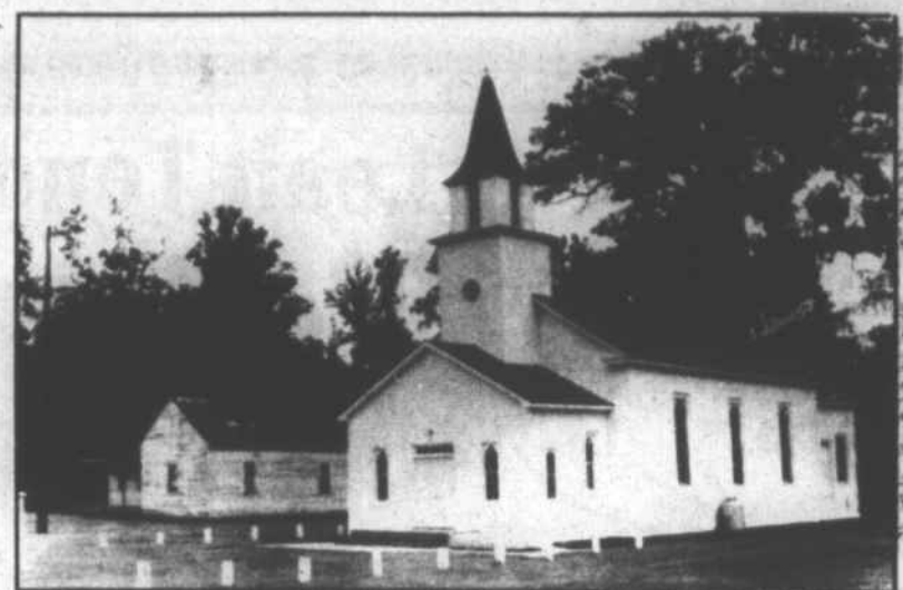
Porter's Chapel A.M.E. Zion Church

As of press time no information was available concerning Winslow's Temple.