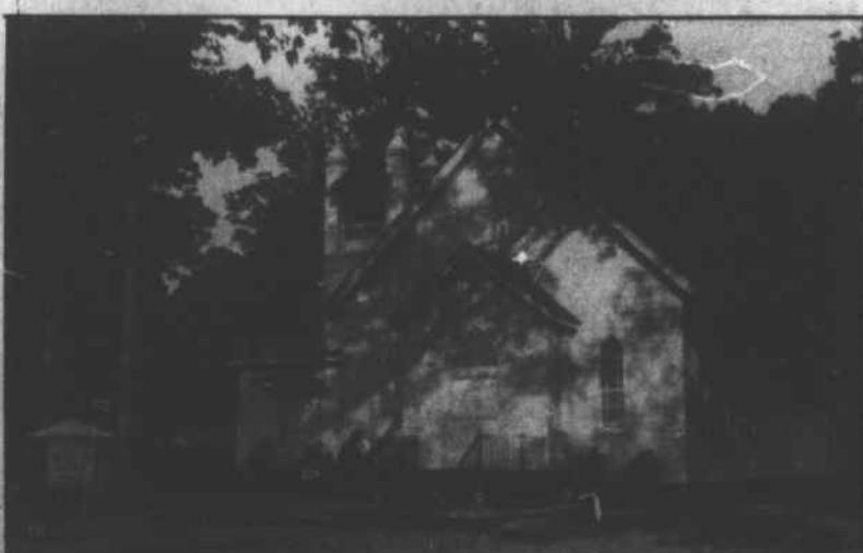
Woodland United Methodist Church