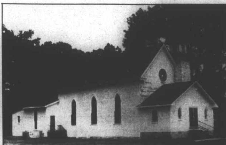
Leigh's Temple A.M.E. Zion Church