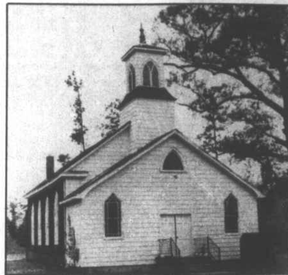
Winslow's Grove A.M.E. Zion Church