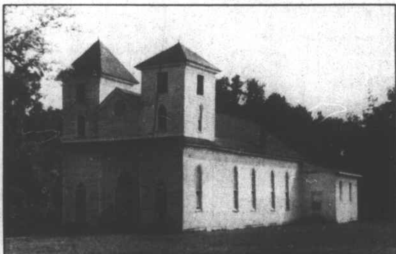
Poplar Run A.M.E. Zion Church