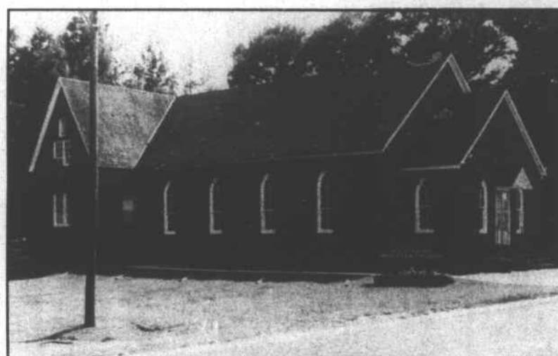
Bagley Swamp Wesleyan Church