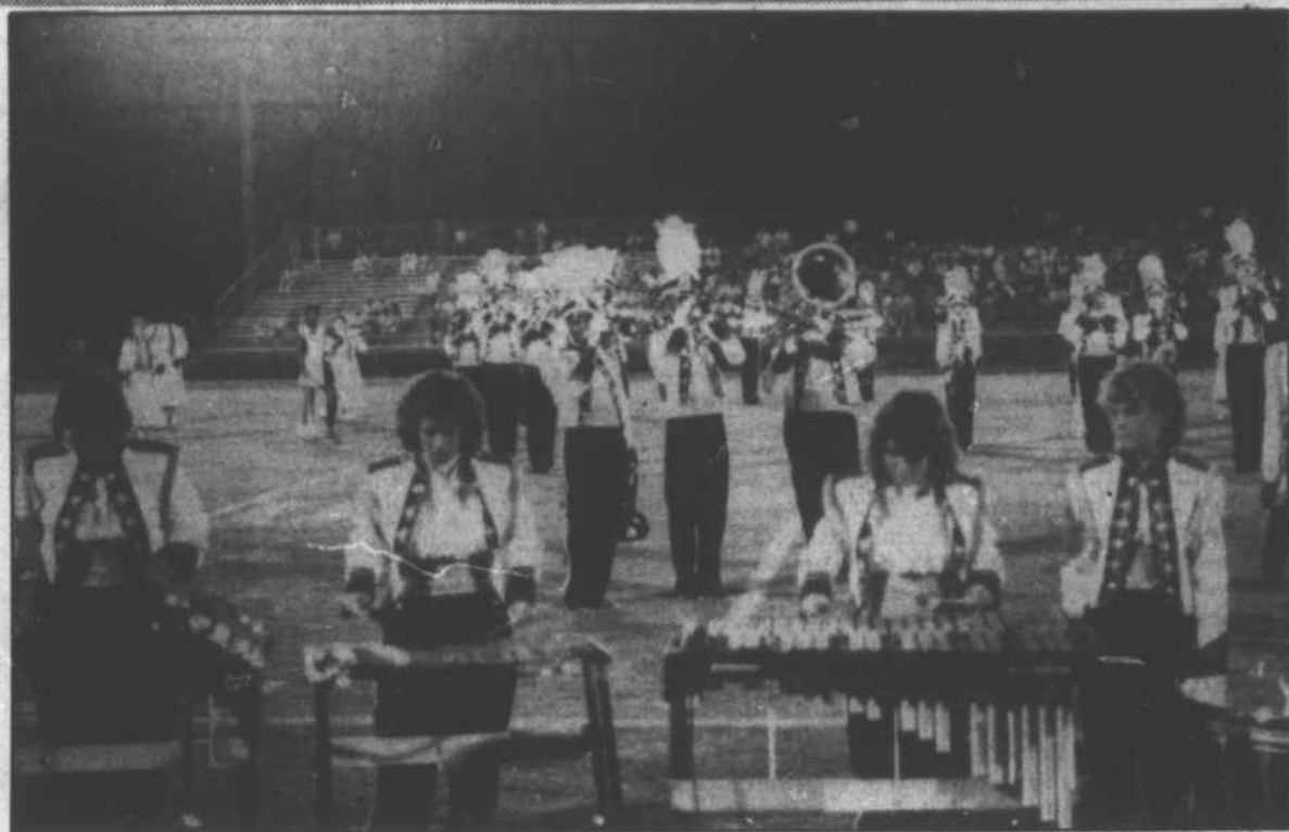
The Perquimans County marching pirates were seen Friday evening marching at half time in their new band uniforms. Everyone agreed that their first performance of the 1987-88 school year was outstanding, and their new uniforms certainly added to the performance. In addition to playing all the football games this year the band will also be taking part in several band competitions.

Veterans are invited to join the local VFW Post, become active members and support the Veterans of Foreign Wars (VFW).