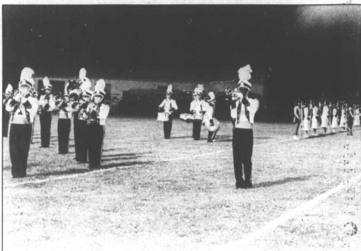
The Marching Pirates are seen performing during last week's homecoming festivities at Perquimans County High School.

Swindell Funeral Home was in charge of arrangements.