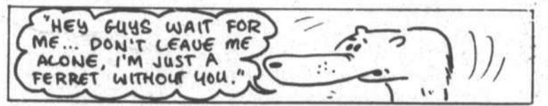
If you have a few ferrets you may officially refer to them as a fesnyng.

Edenton, N.C.—The regular Wednesday afternoon blood pressure screening clinic at Chowan Hospital has been moved back to the lobby, according to hospital officials. The clinic, which had originally been set in the lobby, had been conducted in the Education Wing recently.