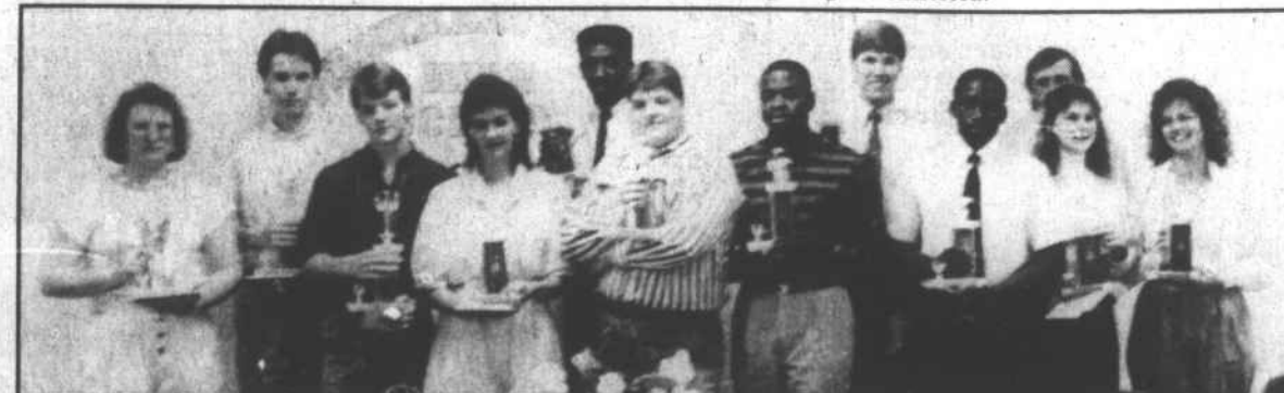
Pictured above are the students honored at Friday's banquet.