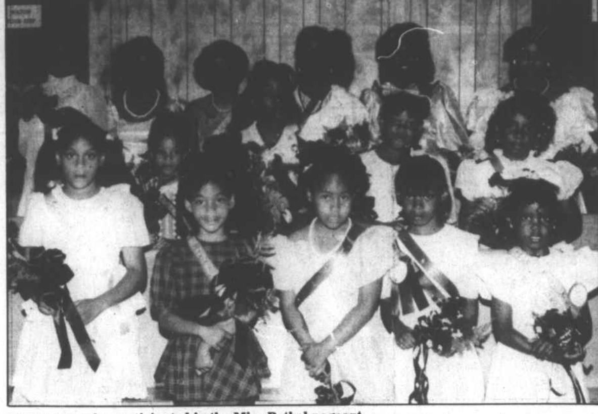
Contestants who participated in the Miss Bethel pageant.

For more information call the local Home Economics Extension Agent or