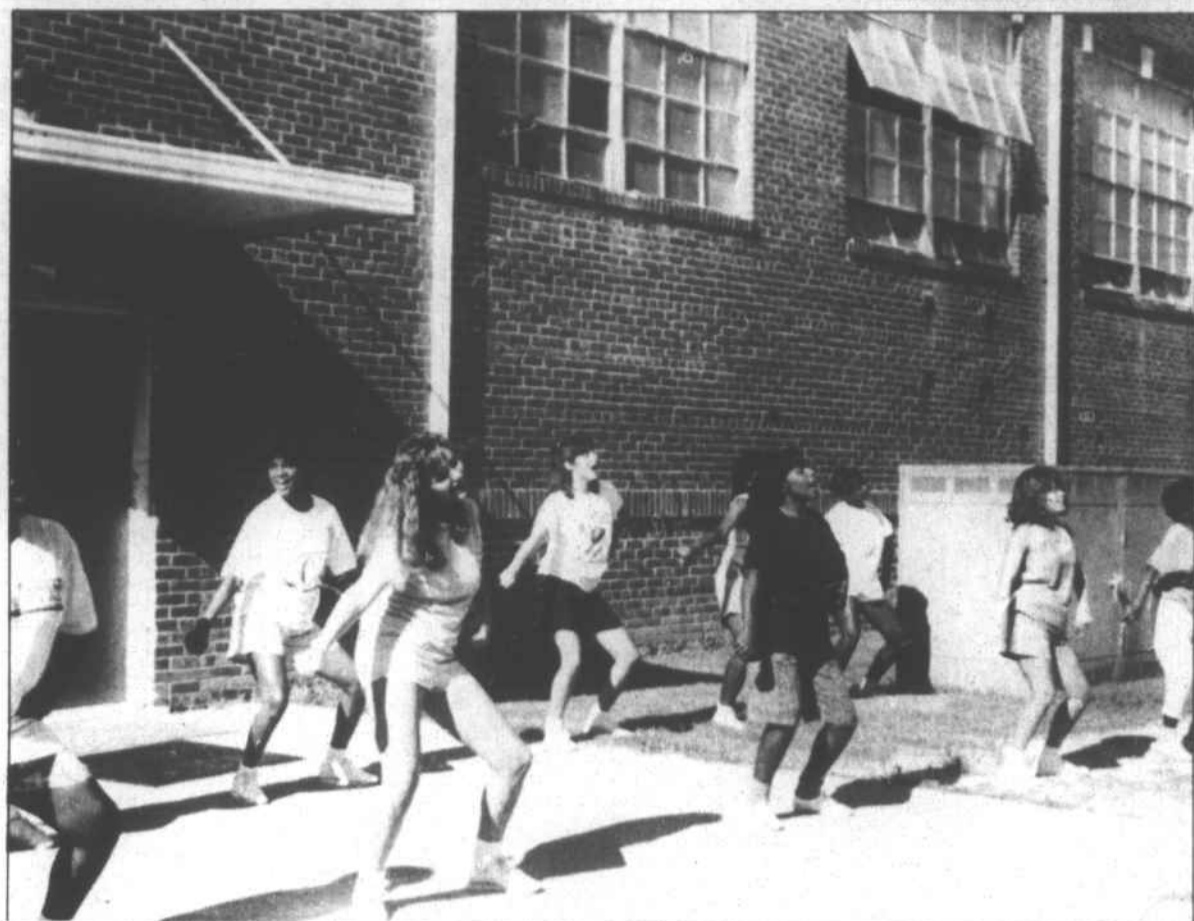
Focused and hard at work!

The Perquimans County High School Cheerleading Squad are gearing up for a new season.